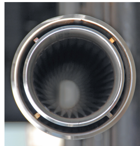
Packing process allows for a thinner filter pack