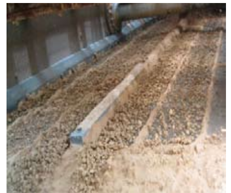
Cross Harp screening limestone

A Cross Harp is made up of single stands of straight highly tensioned wire, connected at both ends of the screen with a sheet metal hook. Spacer strips sit over the top of the capping rubbers to maintain correct aperture, this produces a long, uninterrupted slot between the capping rubbers.